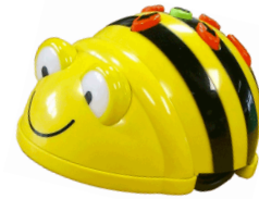
Fig Class - January 2017