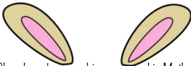
Fig Class have been working very hard in Maths. We have been learning how to use number lines to find more or less than a given number and how to draw on our hops. Today we got our bunny ears on and did big and little hops on a large scale number line to find 1, 2 and 3 more and less than a given number.