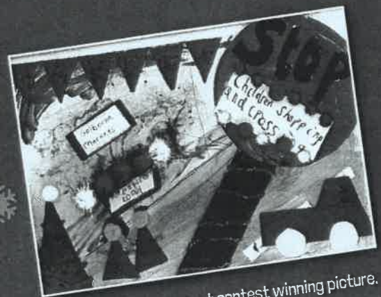
Our School Christmas art contest winning picture.

ALL ARE WELCOME TO SING ALONG WITH LOCAL SCHOOL AND ADULT CHOIRS.